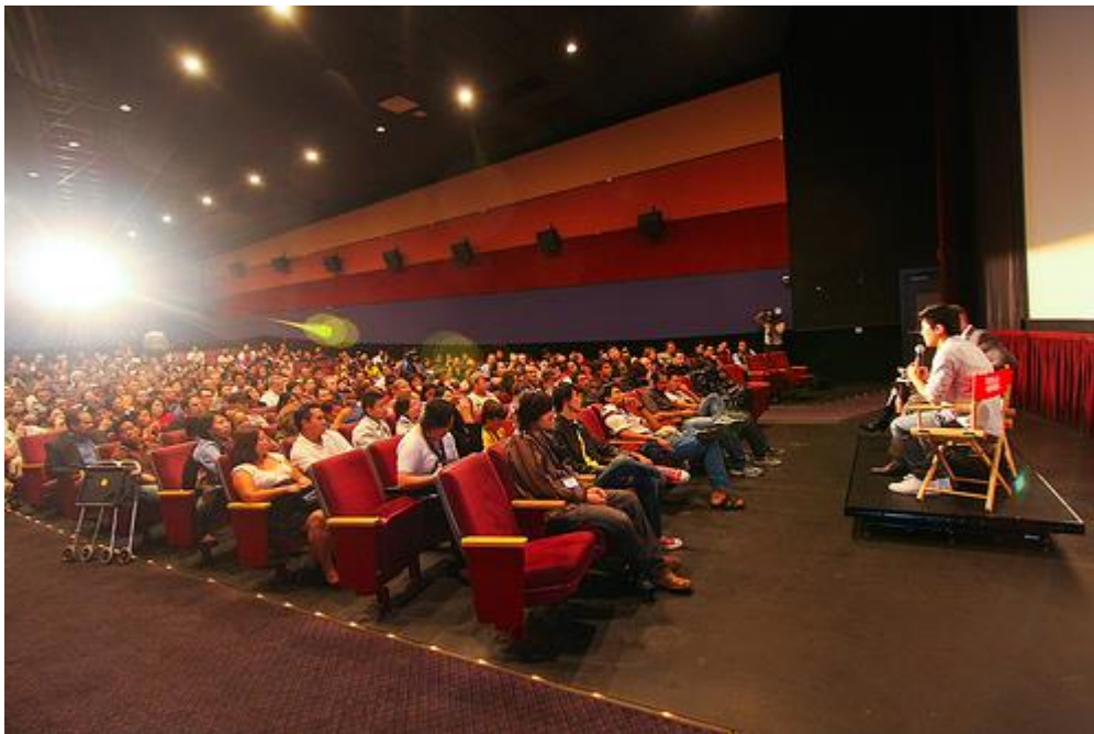
Transforming lives through cinema